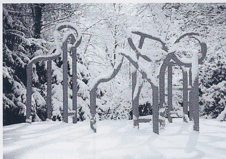
Studio 80's Sculpture Grounds look stunning in snow!